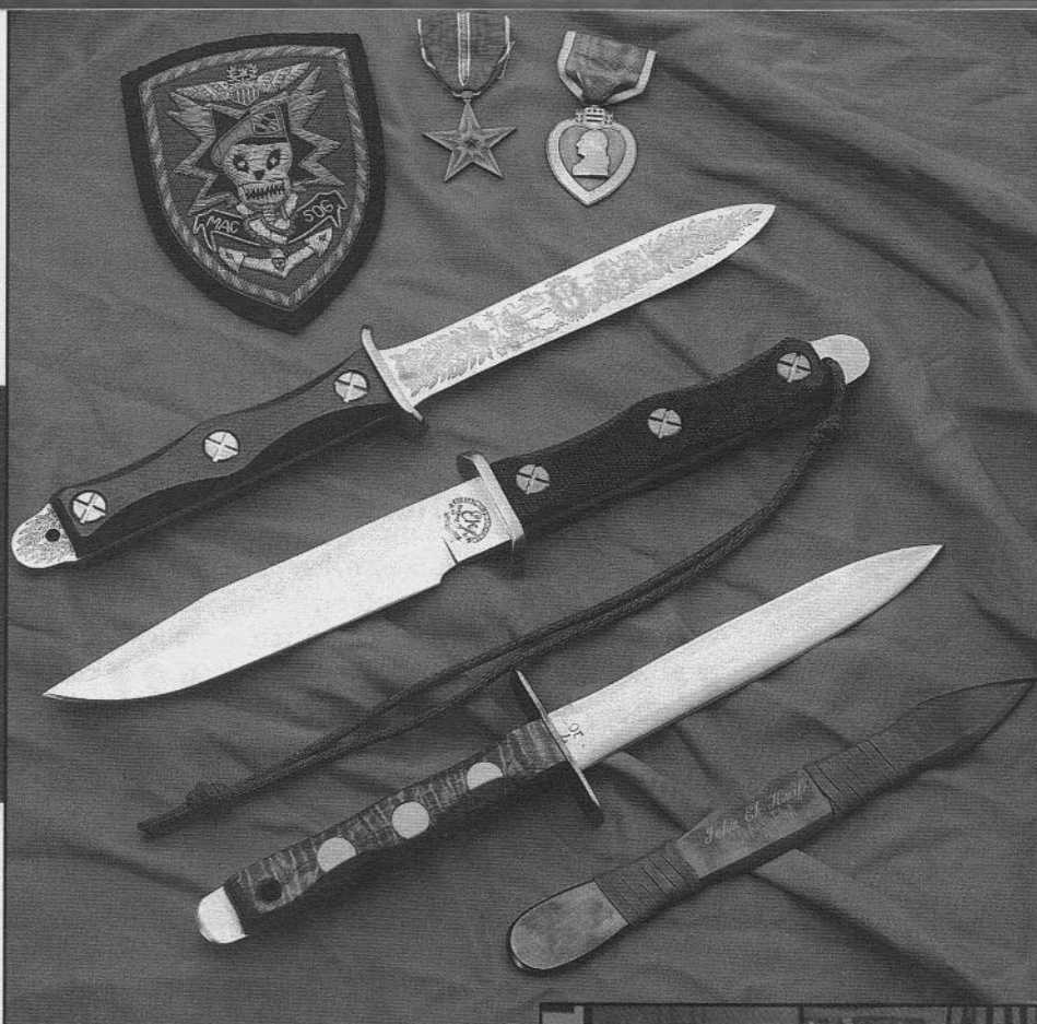
(Above) Ek Commando has a little bit of everything for the retailer's sales needs. From top: The Army edition from the American Elite Fighting Forces Collection; the Ek Bowie; a vintage Ek combat knife; and an Ek throwing knife. In addition to these models, Ek has some big-game hunting knives and other pieces planned.