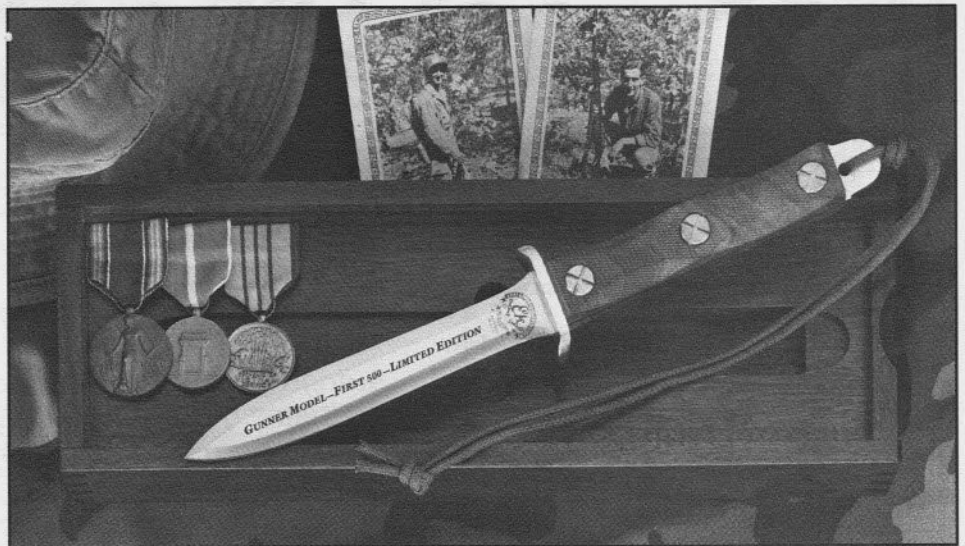
(Above) The Gunner Model sports Ek's classic styling, right down to the blade and ergonomically shaped handle, and includes a recent company design addition—checkered grips. The knife comes in a limited edition of 500.

Why are Ek knives collectible? One reason is that it's so hard to get people to part with their original Eks. It's partly such people's reluctance to sell their old Eks that has resulted in a collectible aura that has been passed on to modern-day Ek knives—not to mention contemporary Eks' fine workmanship and styling.