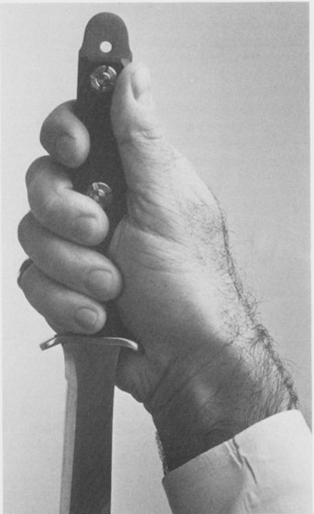
Blade-rearward cross-palm grip