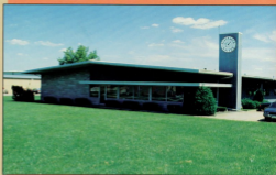
Blackjack Knives, Ltd. headquarters located in Effingham, Illinois.