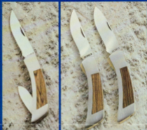
PK-1 —Two stainless steel blades: 3" trailing point blade for general cutting (.100" thick), and 1½" drop point auxiliary blade, extra thin (.055") for razor fine shaves. Length open, 7"; closed, 4". Leather scabbard optional.

Like all Gerber Folders, each PK blade is custom-matched and fitted to a specific frame. Each is skillfully hand-honed and hand-inspected. Not a random sample mind you, but every single knife.