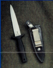
Mark I Survival Knife. 4 1/2" blade, overall length, 9". Blade thickness, .250". Comes with leather belt/boot scabbard featuring thumb-release straps and metal clip for boot or belt.

The extra thick blade steel is different than any of our other knives. It's a special alloy tool steel, selected for its combination of toughness and shock resistance. Gerber craftsmen carefully hone this steel into a keen, double-edged instrument with a strong aluminum alloy handle. An Armor-Hide coating is then fused to the handle to create a virtually slip-proof surface.