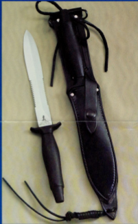
Mark II Survival Knife 6 1/2" blade with serrated edge near tip for heavy cutting. Overall length, 12". Blade thickness, .250". Comes with leather scabbard featuring leg tie thong. Available with 5" Spornomah's Steel or without as shown.