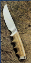
5255—5 1/2" heavy duty hunting blade. Overall length, 10 1/2". Blade thickness, .187".